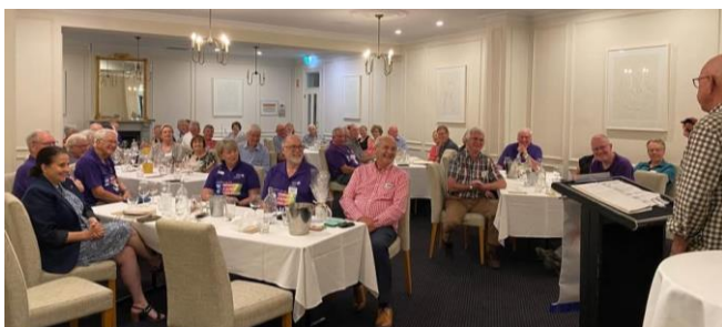
The 2025 joint meeting of the Rotary Clubs of Mitcham and Blackwood